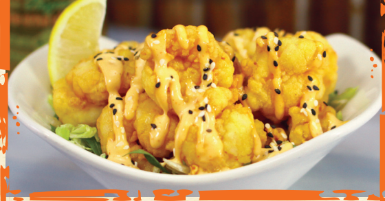
LAVA LAVA SHRIMP

Hand-breaded dill pickle chips, served with our ranch dipping sauce (680 calories) $10.99