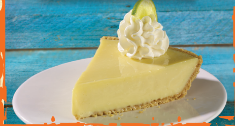
HOMEMADE KEY LIME PIE

Topped with Monterey Jack cheese, applewood-smoked bacon, lettuce, tomato, pickles and ranch dressing** (1010 calories) $15.99