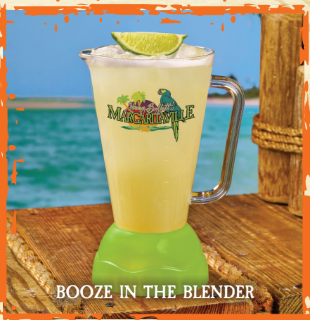
BOOZE IN THE BLENDER

Corazon® Blanco Tequila, Margaritaville Triple Sec, wildberry purée, and our house margarita blend. Served on the rocks (280 calories) $9.50