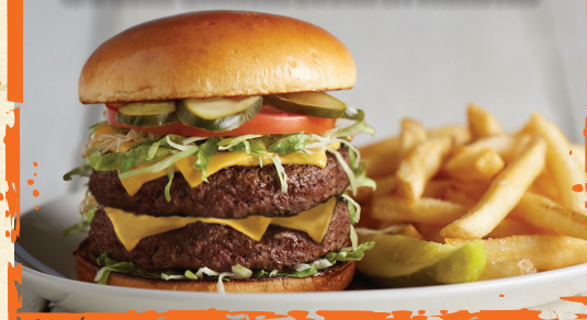
DOUBLE CHEESEBURGER IN PARADISE®

Shredded iceberg lettuce, seasoned ground beef, cheddar and Monterey Jack cheese, diced tomatoes, black beans, diced cucumbers, roasted corn and avocado tossed in ranch dressing, topped with crispy tortilla strips, queso fresco and cilantro. Served with fresh guacamole and sour cream (1330 calories) $18.50