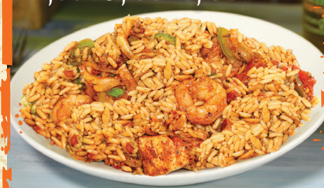
JIMMY'S JAMMIN' JAMBALAYA®

Our Hand-Battered Chicken Tenders served with French fries and your choice of Buffalo, honey mustard or BBQ sauce (1380-1540 calories) $16.50