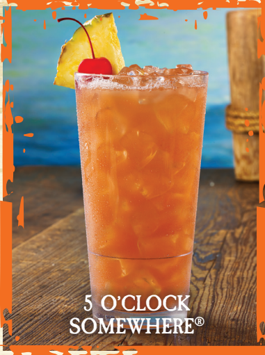
5 O'CLOCK SOMEWHERE®

RED PINOT NOIR Prophecy, California (150-630 calories) MERLOT Chateau Souverain, California (150-630 calories) RED BLEND Apothic, California (170-710 calories) MALBEC Alamos, Argentina (120-510 calories) CABERNET SAUVIGNON Athena, California (130-660 calories)